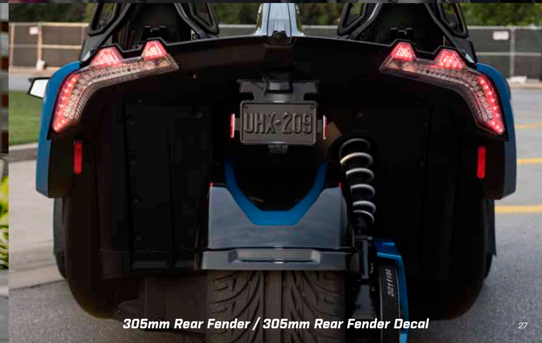
305mm Rear Fender / 305mm Rear Fender Decal