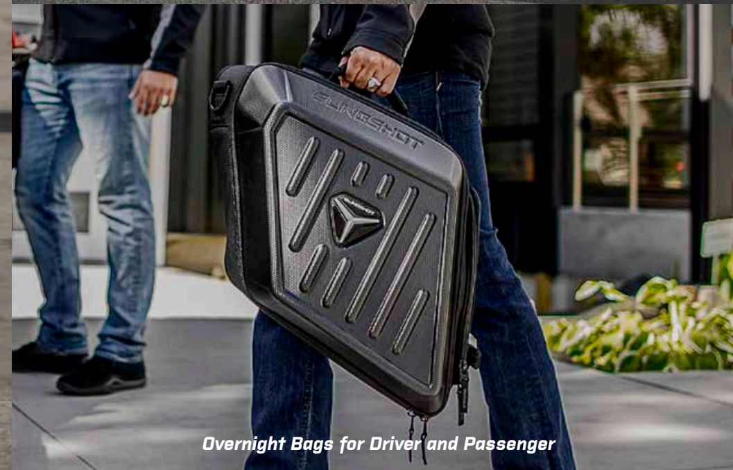
Overnight Bags for Driver and Passenger