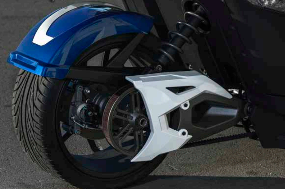
265mm Rear Fender / 265mm Rear Fender Decal / Painted Belt Guard