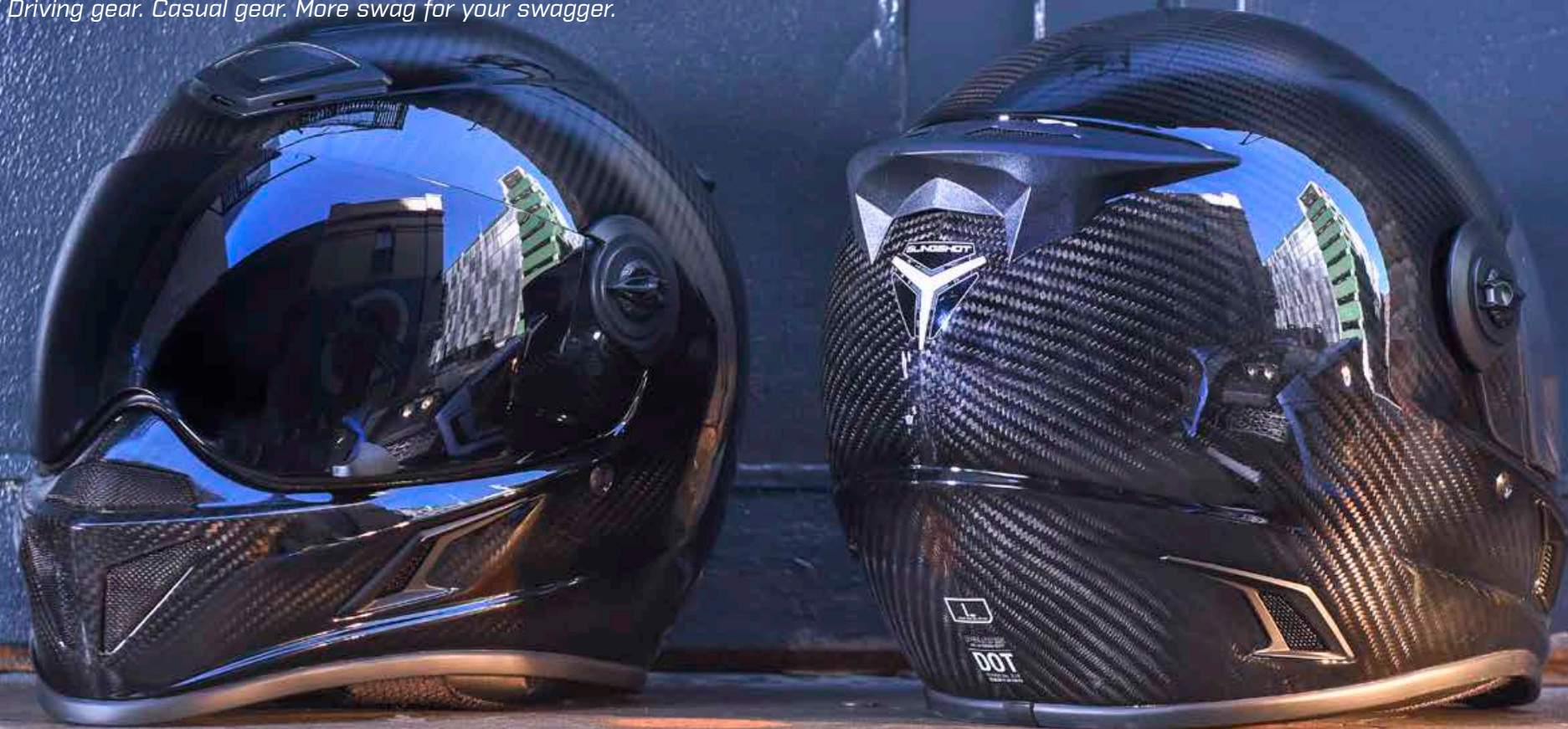
Slingshot® Carbon Fiber Helmets

Driving gear. Casual gear. More swagger for your swagger.