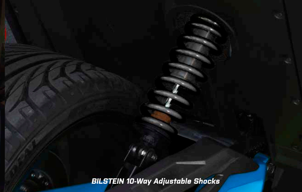
BILSTEIN 10-Way Adjustable Shocks