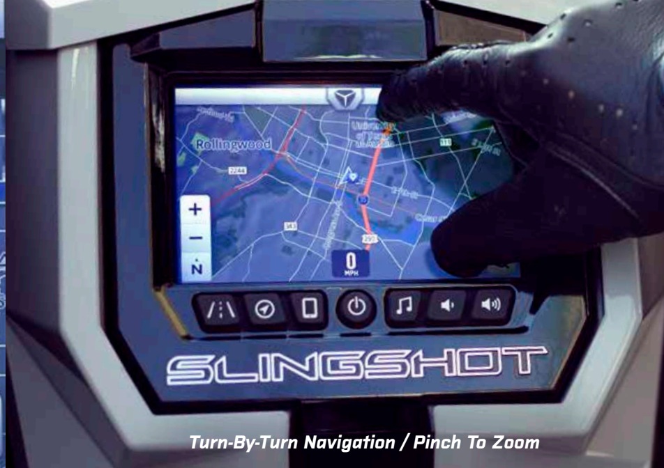
Turn-By-Turn Navigation / Pinch To Zoom