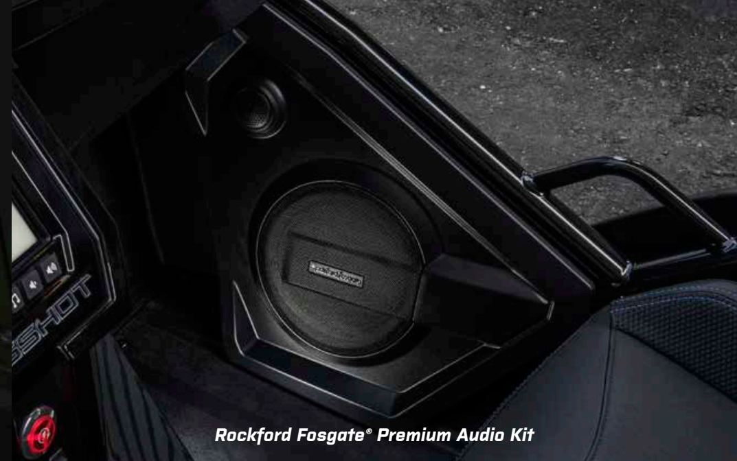
Rockford Fosgate® Premium Audio Kit