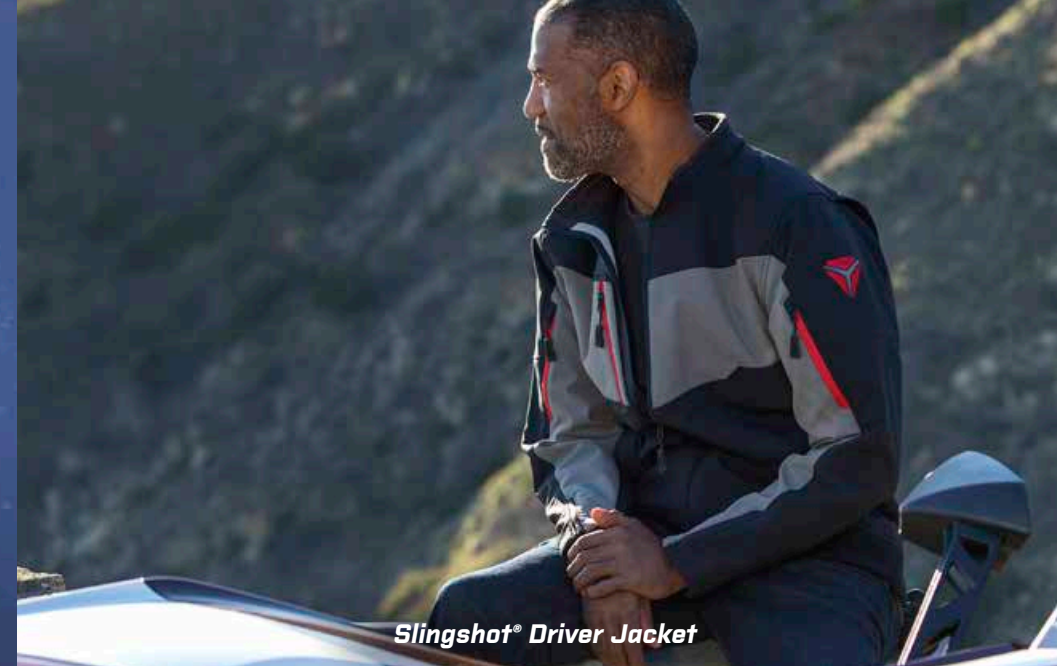
Slingshot® Driver Jacket