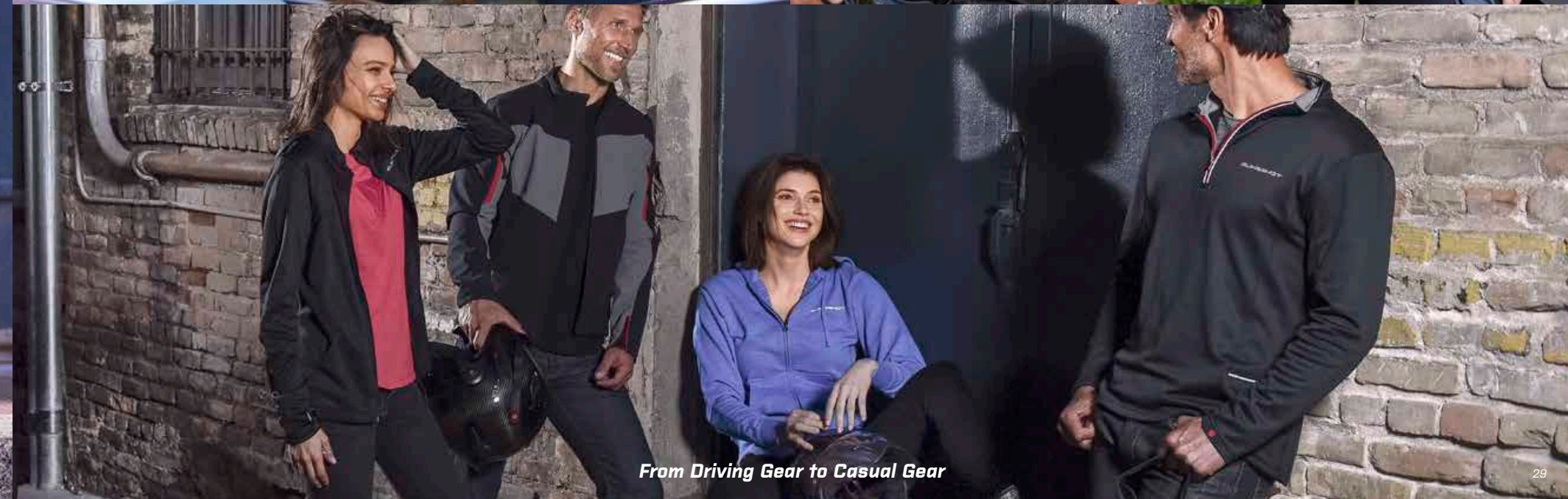
From Driving Gear to Casual Gear