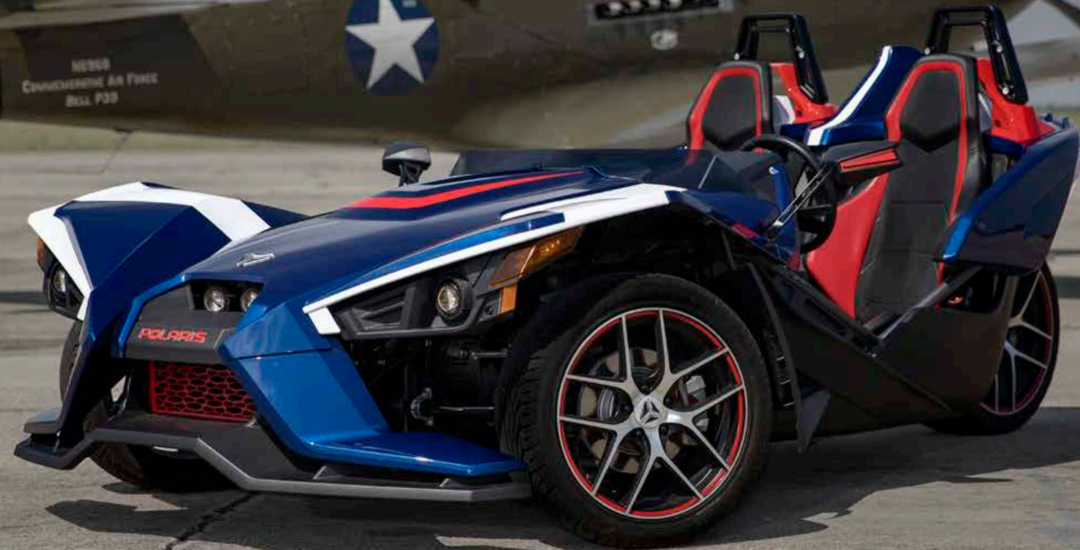
Exterior Painted-Accent Kit / Painted Front Grille / Rim and Mirror Decal Kit / Painted Lower Hoop Accent Kit / Velocity Street Sport Seats / Center Hood Decal Kit

Color-matched. Precision-fit. Grab attention like you grab every corner.