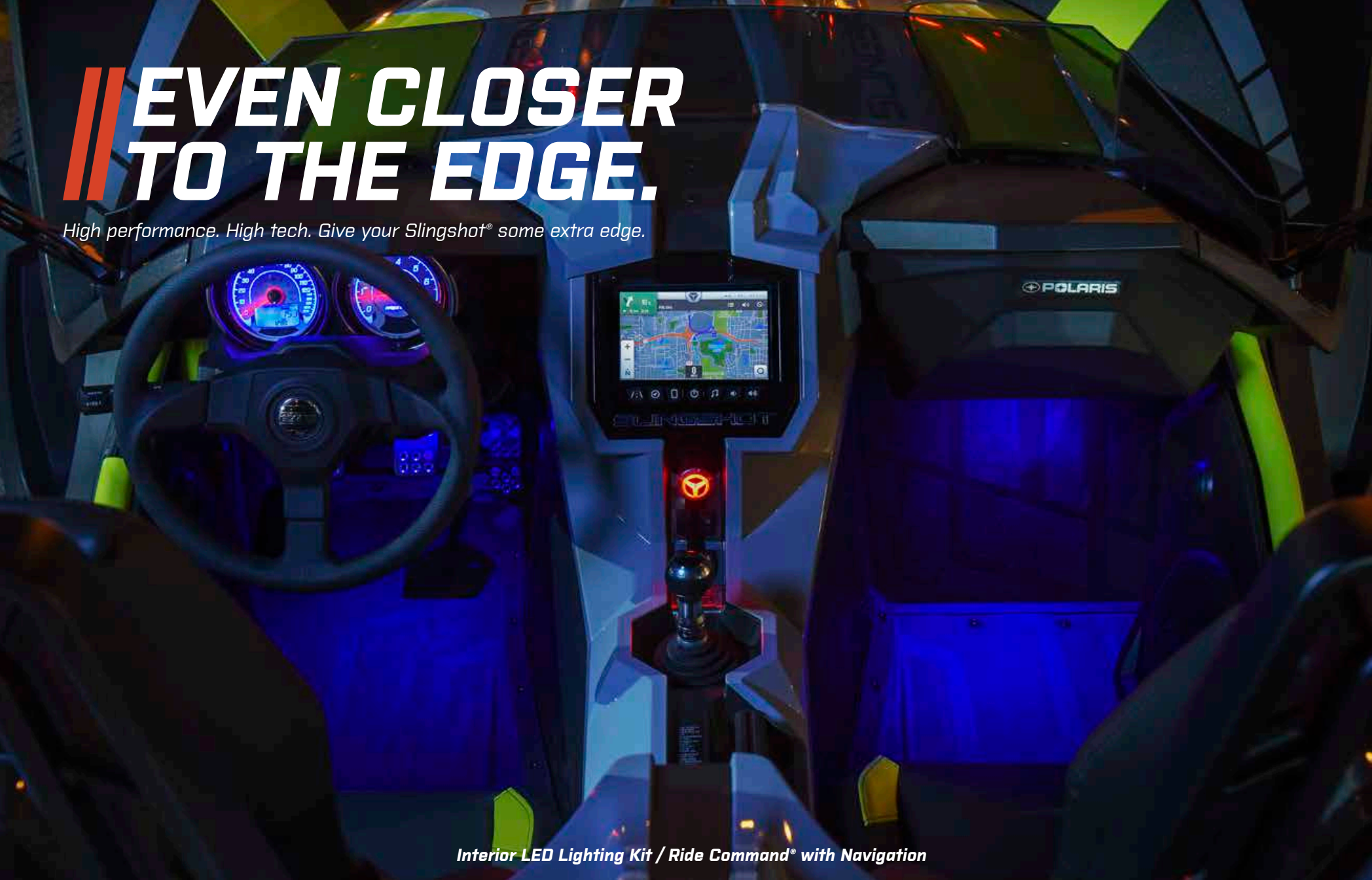
Interior LED Lighting Kit / Ride Command® with Navigation

High performance. High tech. Give your Slingshot® some extra edge.