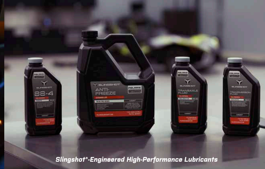
Slingshot®-Engineered High-Performance Lubricants