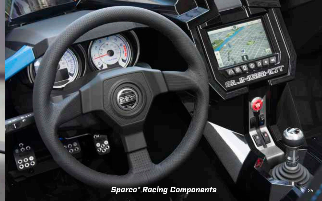
Sparco® Racing Components