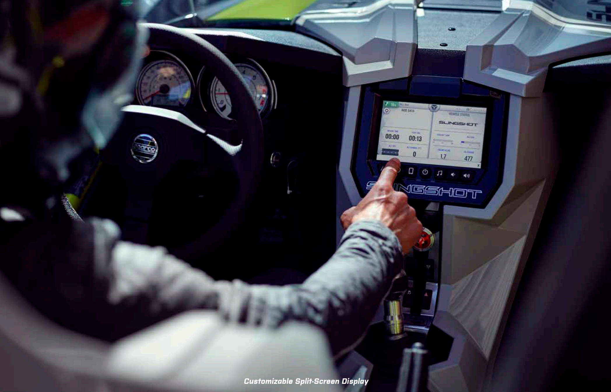
Customizable Split-Screen Display