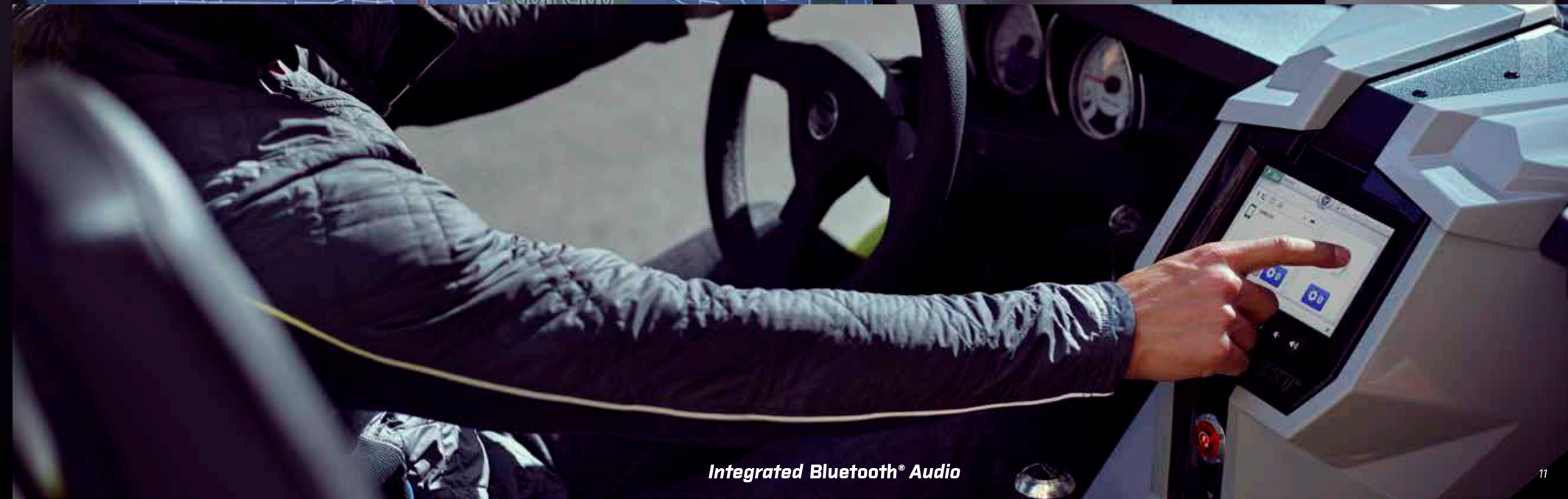
Integrated Bluetooth® Audio