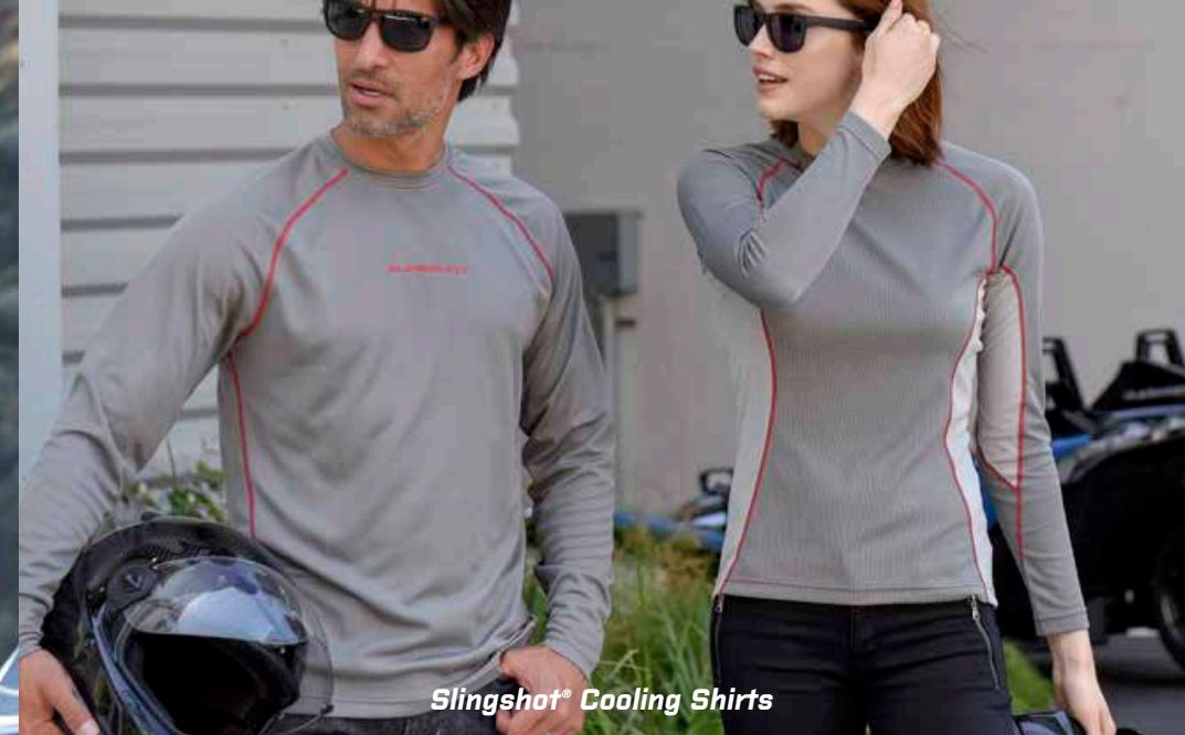
Slingshot® Cooling Shirts