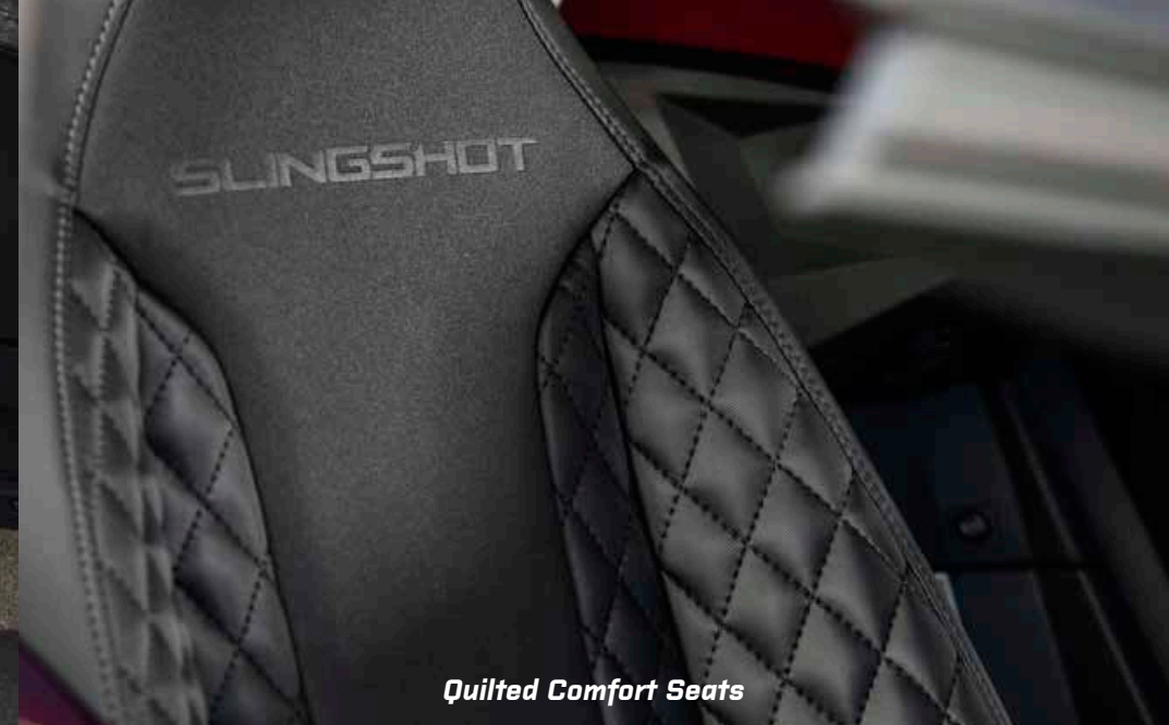
Quilted Comfort Seats